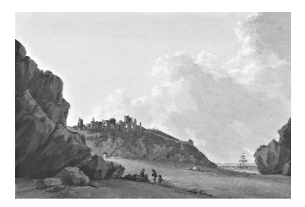
A View of Tenby, Looking toward the Castle, with the Welsh Coast in the Distance, by John 'Warwick' Smith (1787).