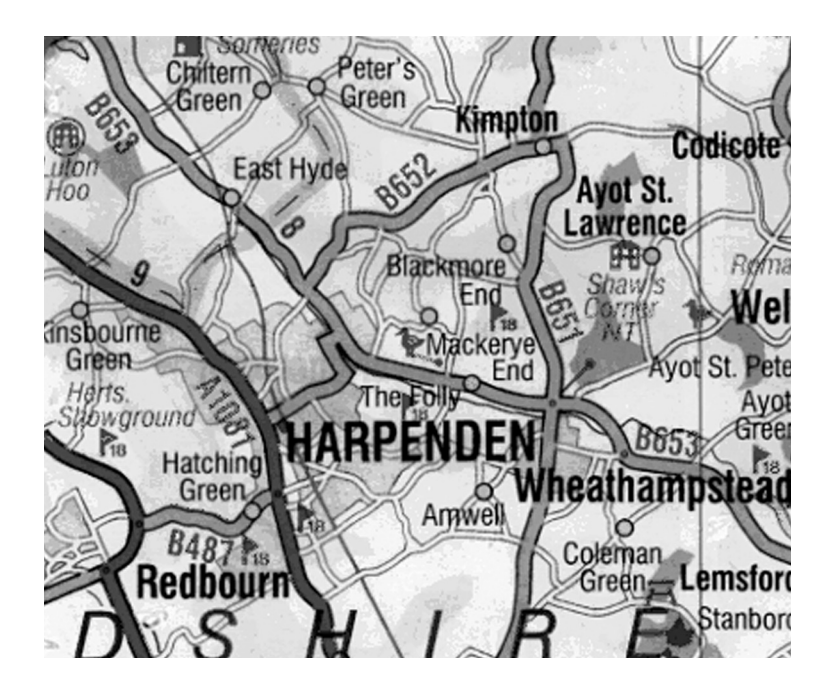
Map 2: Modern-day Harpenden showing Redbourn and Kimpton

mile to the northeast of Harpenden or one mile to the southwest on the same line of circumference from Gracechurch Street as the town of Harpenden itself; that is to say, still twenty-four miles from Gracechurch Street but also one mile to the northeast or southwest of the town.